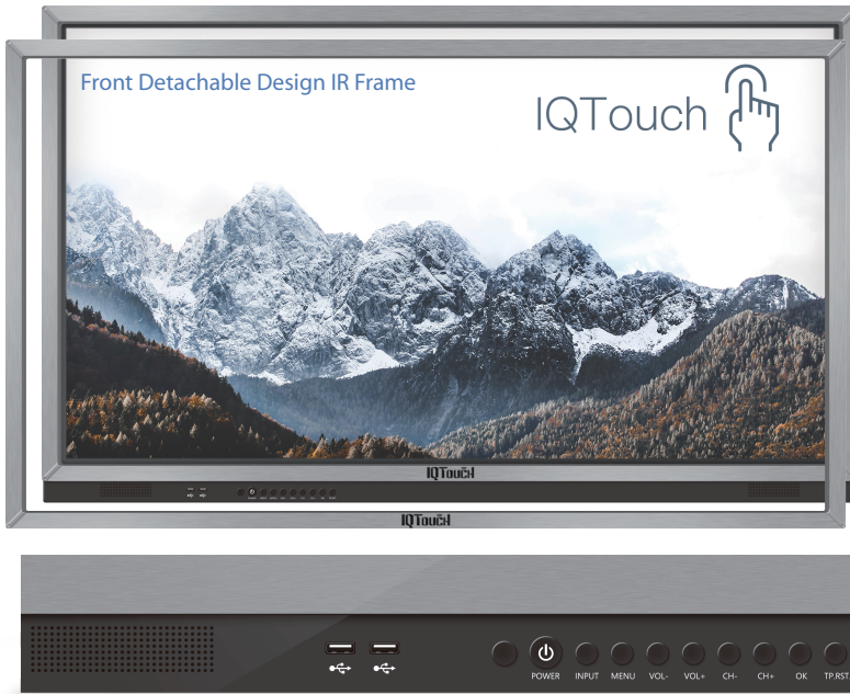
Front USB Ports & Buttons

IQTouch, the new series of interactive flat panel family, creates smooth and natural writing experience with the unrivalled IR touch screen technology. Bundled with the IQClass 6.0 or installation-free IQClass Plus software, you can achieve plenty of teaching functions as multi-screen interactivity, student vote activity, cloud-based resource, etc.